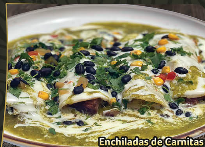
Enchiladas de Carnitas

Marinated tender strips of chicken with ranchero cheesy sauce dip, served with rice and beans.