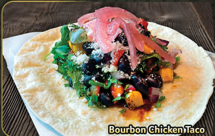
Bourbon Chicken Taco