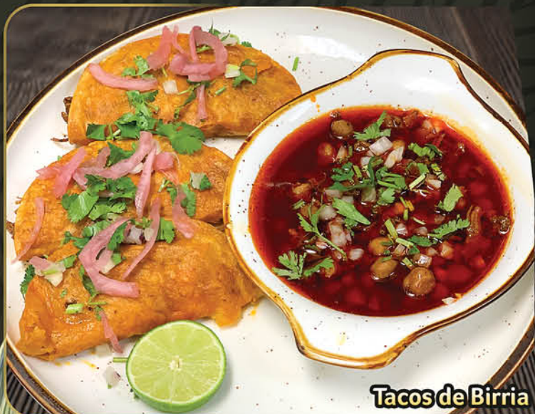
Tacos de Birria