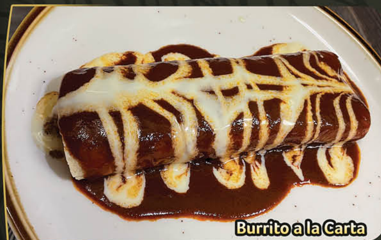
Burrito a la Carta