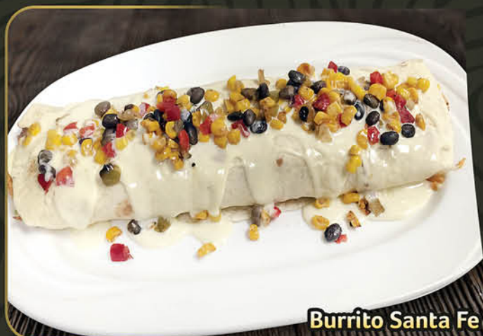
Burrito Santa Fe

12" tortilla chicken chorizo, onions & mushroom with warm white rice, savory corn & black beans, crisp lettuce, creamy sour cream, sliced tomatoes, a blend of melted Mexican cheeses and then drizzled with cheese dip & corn sauce on top.