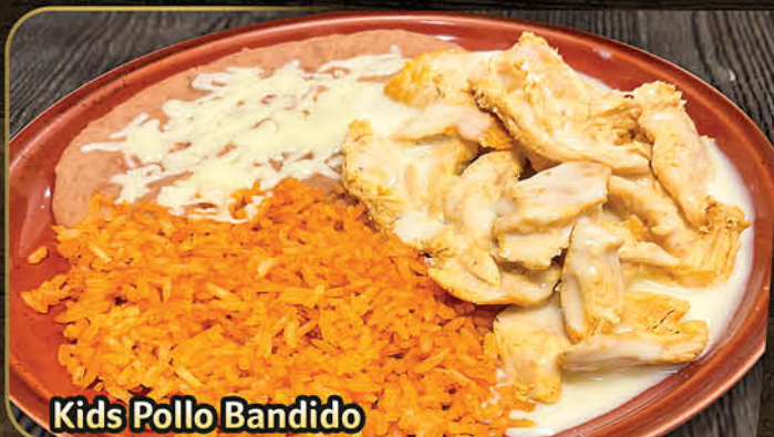
Kids Pollo Bandido

One grilled beef or grilled chicken burrito topped with lettuce, tomatoes, and guacamole by request served with rice and beans.