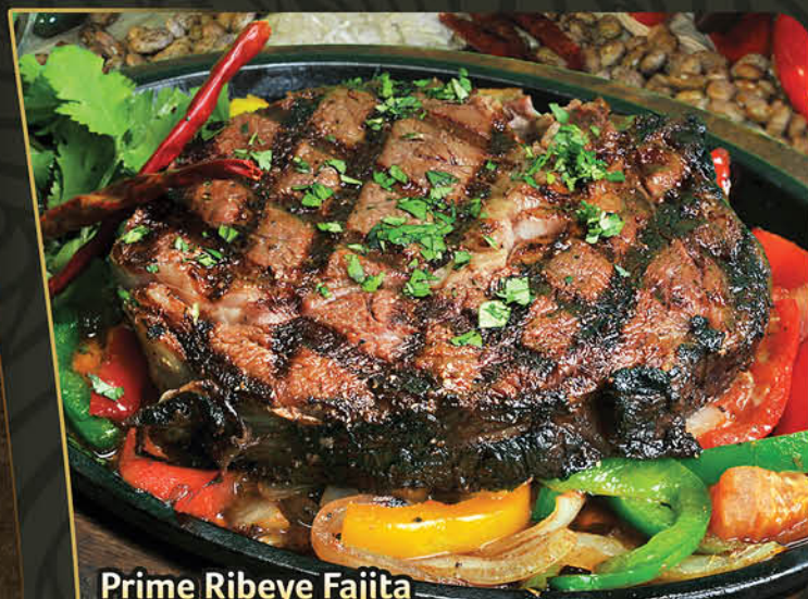
Prime Ribeye Fajita