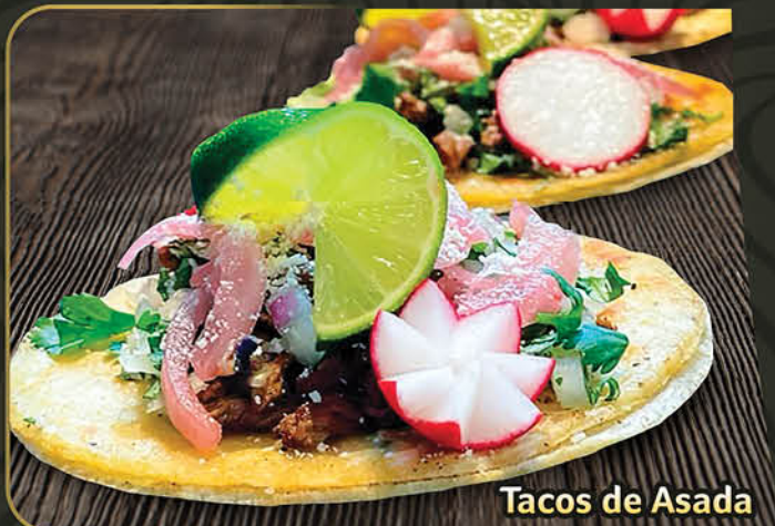
Tacos de Asada

Three slow cooked juicy brisket birria tacos with melted cheese, onion, cilantro, and rich consommé on side for dipping!